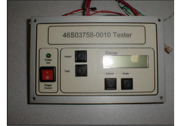
User Interface Assembly