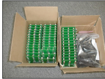
Lot of PCB Assemblies